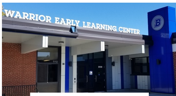
Warrior Early Learning Center 5546 Fairview Rd Baxter, MN 56425 218-454-5430