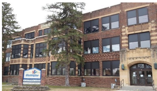
Washington Educational Services Building 804 Oak St. Brainerd, MN 56401 To be determined for 2023-24 school year